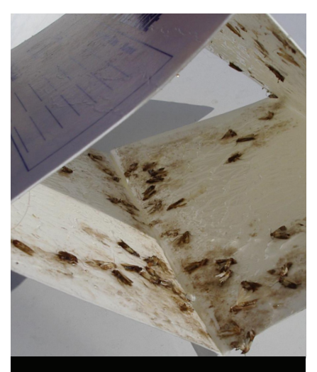
Pest management professionals will be able to identify the species of moth and the extent of the infestation using monitoring traps.

Then deep clean your cupboards, pantry or anywhere food has