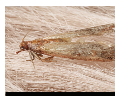
Common Clothes Moth (Tineola bisselliella)

This is currently the most important and widespread clothes moth pest throughout the world and has been present in the UK since the 1800's.