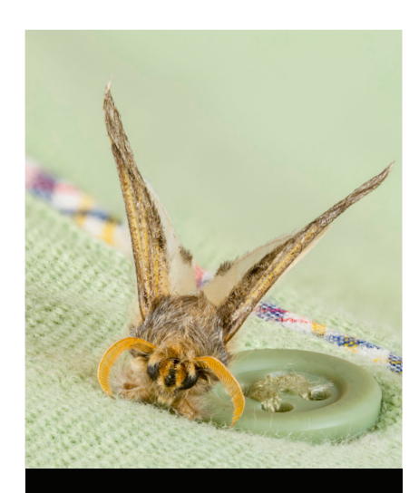
A moth is a type of winged insect of the order Lepidoptera.

Whether you're thinking about doing some DIY pest control or you're looking to enlist the help of a professional pest management company, this guide is for you.