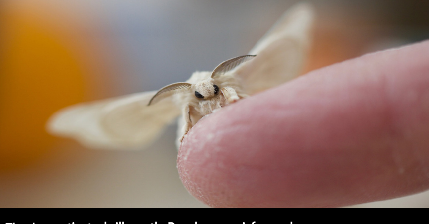
The domesticated silk moth, Bombyx mori, farmed for the silk with which it builds its cocoon.

Fun fact: Not all moths are bad for business. The silkworm, the larva of the domesticated moth Bombyx mori, is farmed for the silk with which