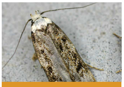
White-shouldered house moth (Endrosis sarcitrella)

Sometimes they can be a simple nuisance and no more, but in large numbers they are distressing.