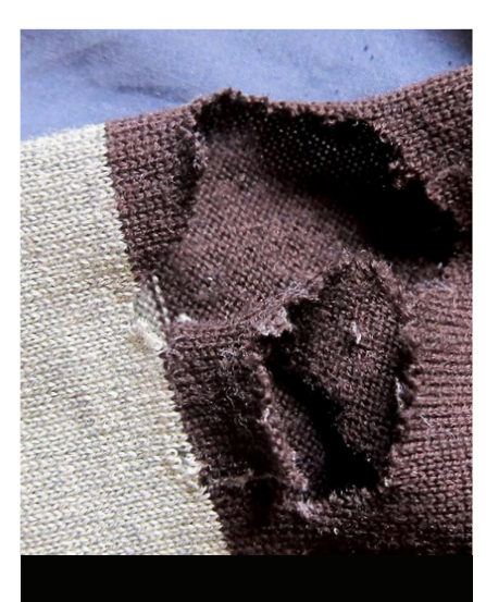
Clothing that has been extensively damaged by clothes moths.